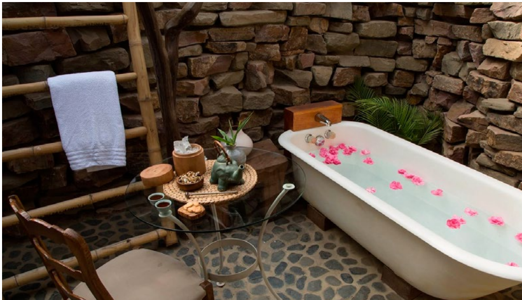
AMAVEDA AT KICHIC Piura, Perú